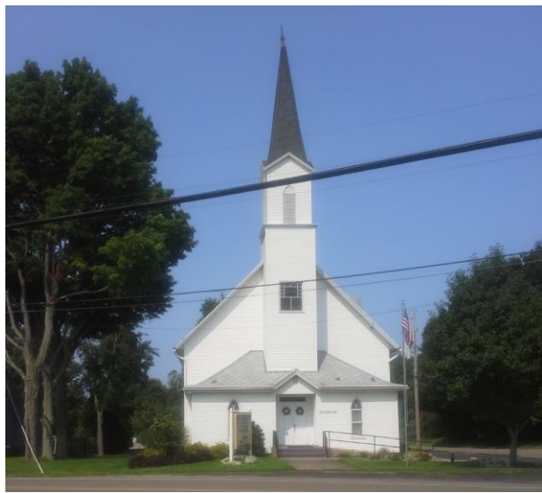
St Jacob's Community Church of Cairo 6169 Kent Ave NW

The Plain Township Historical Society is looking for pictures, notebooks, letters, newspaper articles, school related items, business advertising, land abstracts and writings pertaining to the history of the township for our archives and research. These items can be donated to the society or loaned to the society for copying.